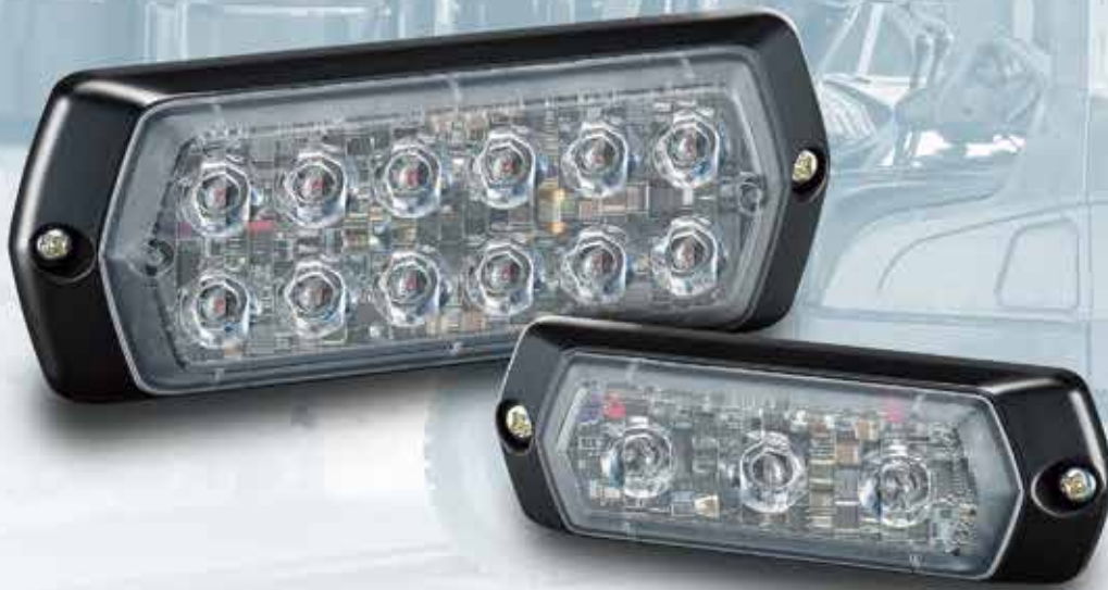
Luminous Color Type