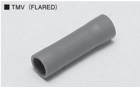
■ TMV (FLARED)