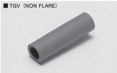
■ TGV (NON FLARE)